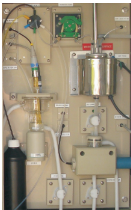
WAD 1000-S Wet Box

On-line measurement offers fast and repeatable results. The analysis cycle time is of the order of 20 minutes per analysis.